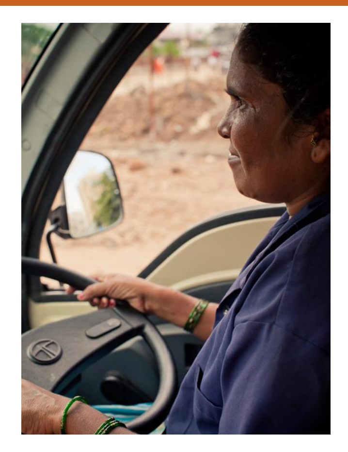
Woman waste picker from SWaCH Cooperative in Pune, India.

Formalization needs to factor in a livelihoods perspective