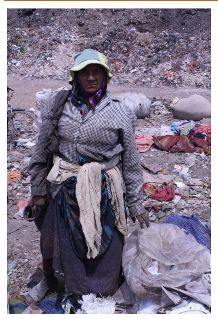
Landfill in Ahmedabad, India

"I have been working at the dumping ground in Ahmedabad for 30 years. My mother-in-law picked waste for a living, and so does my daughter-in-law..."